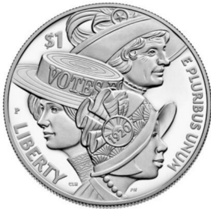
Left: The obverse of the Women's Suffrage Centennial 2020 Proof Silver Dollar

$10 for each silver dollar and medal go to the Smithsonian Institution's American Women's History Initiative for research and creation of women's history exhibits.