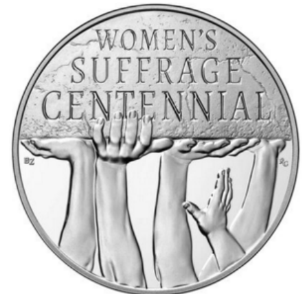
Right: The obverse of the Women's Suffrage Centennial 2020 Medal