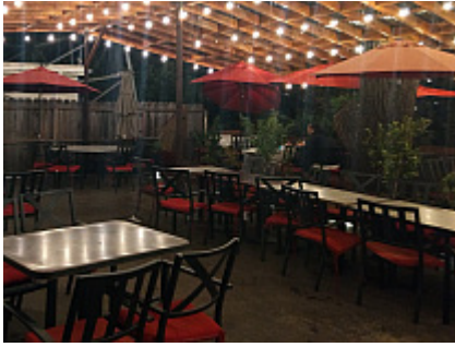
(Left) The patio for our banquet.

Your meal choices are: Lasagne Meat Sauce, Chicken Parmigiana, Grilled Wild Salmon, or Veal Piccata. Dinner includes fresh green garden salad, bread & butter, coffee or tea, and a house-made dessert. The cost is